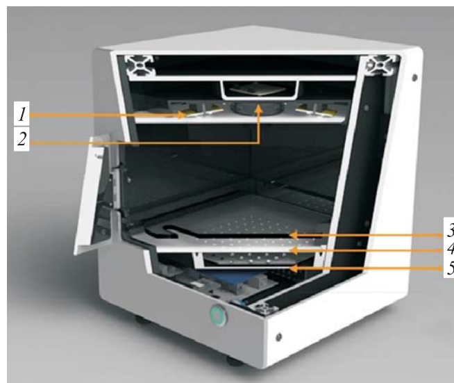
Fig. 1. Hardware and software complex:

A hardware and software complex developed by the authors was used for experimental studies [15] (Fig. 1). The complex consists of upper and lower sources radiating in the visible and infrared ranges, scattering plate, special cassette with 100 cells for placing grain samples and television camera with a lens transmitting digital images of grains to the personal computer for consequent processing.