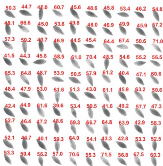
Fig. 3. Obtained results visualization

The general vitreosity indicator is useful, when it is necessary to provide a general characteristic of the grain sample. However, more information is required to evaluate the sample uniformness under this indicator. Grain distribution histograms in terms of transmittance were built for each sample of barley sample presented for this purpose (Fig. 4).