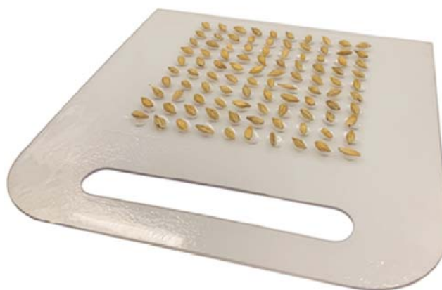
Fig. 2. Test samples arrangement in the cassette

consisted of two blocks, including digital image segmentation and general vitreosity calculation.